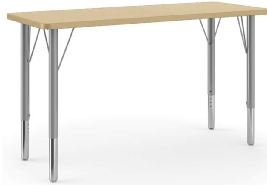
K-2 New Student Tables & Chairs