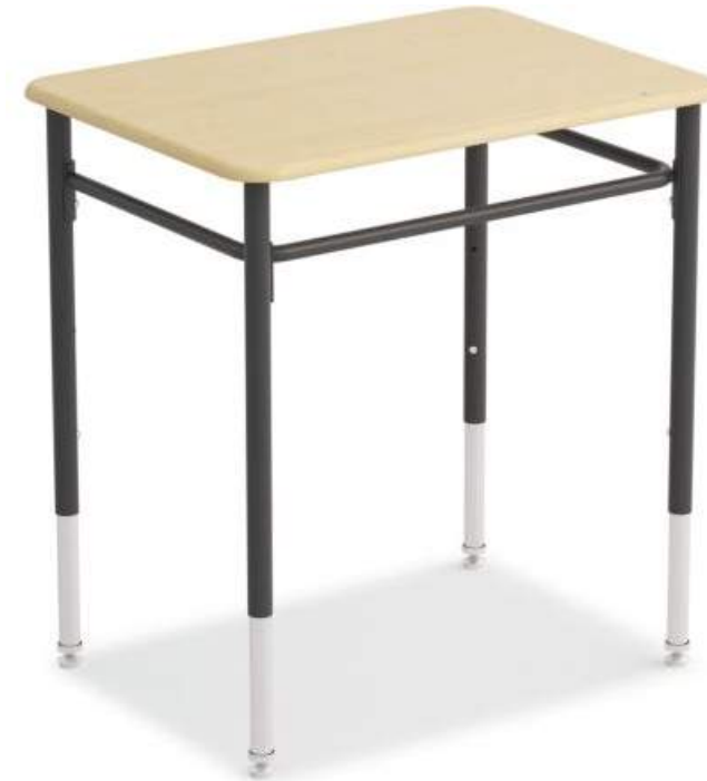
3rd-5th New Student Desks with bookbox & Chairs