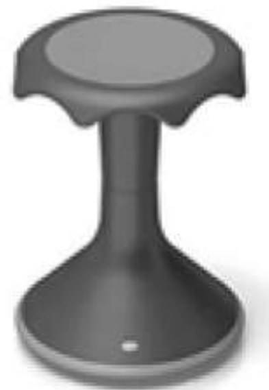
Optional wobble stool