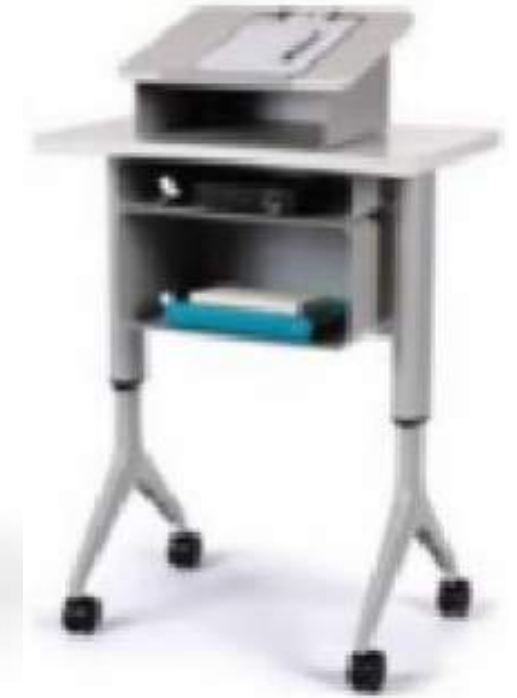
Teacher stool and presentation cart