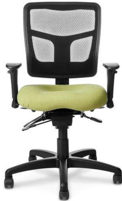
Teacher Desk and Chair